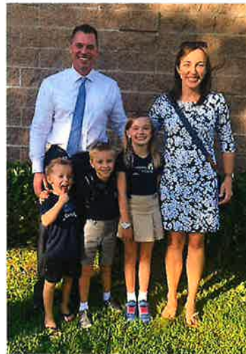
First Day of School - 2019