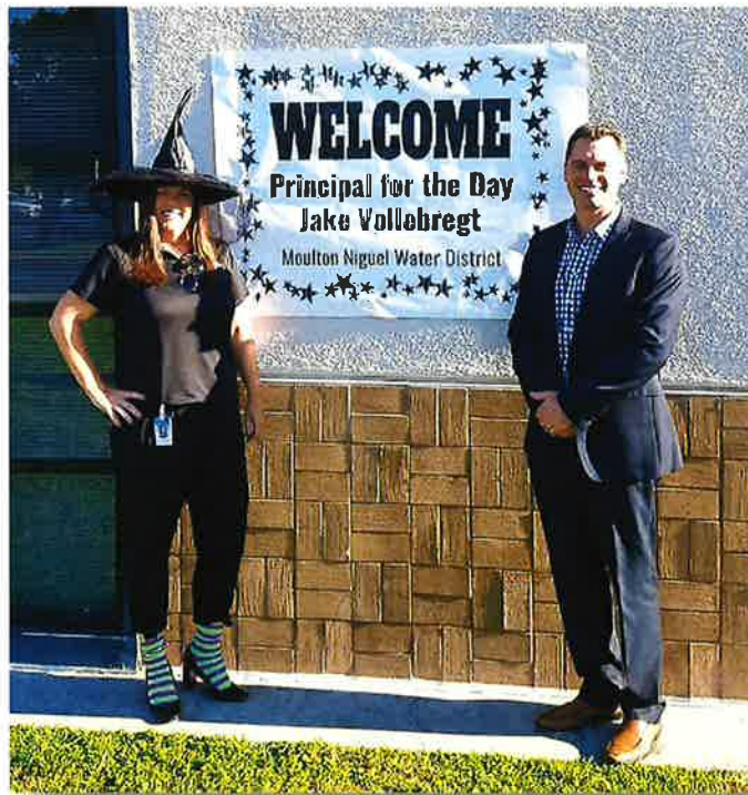
Principal for a Day - October 27, 2017

The greatest challenge CUSD faces is the critical need to renew our schools' campuses and classrooms. Meeting this challenge will require significant investment by our community's stakeholders and leadership. I would like to meet this challenge by ensuring the public's money is spent prudently and strategically. Fostering community dialogue on this critical issue will help ensure that the teachers and students in our community have world class learning environments for generations to come.