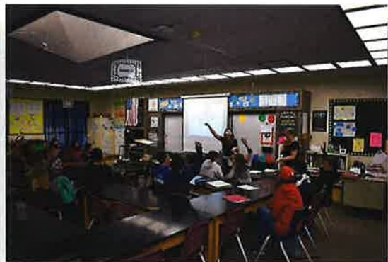
AVMS/MNWD Watershed Visit: Water quality testing with OC Coastkeeper - March 2018